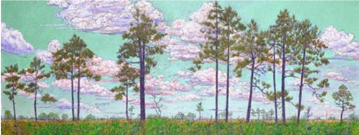
Myakka Prairie Sky , Myakka River State Park, acrylic, 2007, 19 × 48 in.