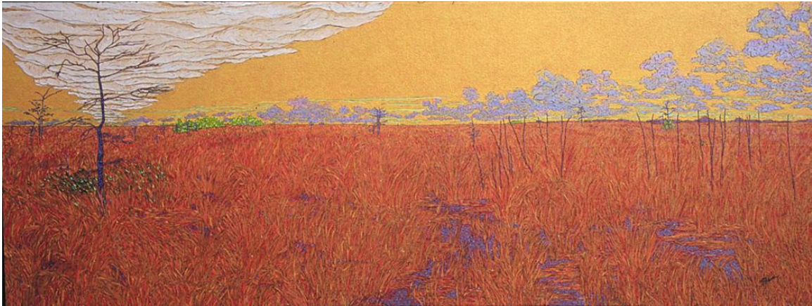
Pa Hay Okee Orange, Everglades National Park, acrylic, 2005, 19 x 49 in.

Kent State University, Kent, Ohio Geiger-Percy Collection, Tallahassee, Florida