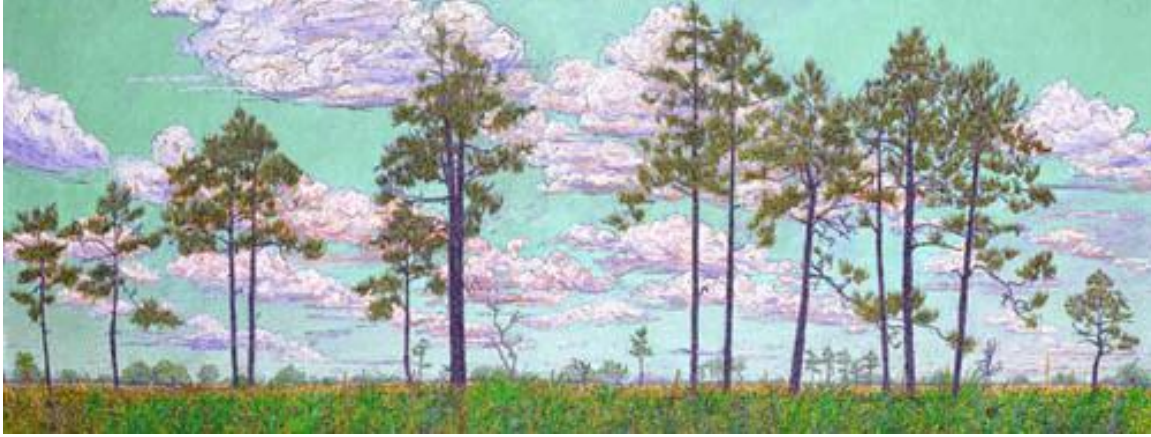
Myakka Prairie Sky , Myakka River State Park, acrylic, 2007, 19 x 48 in.